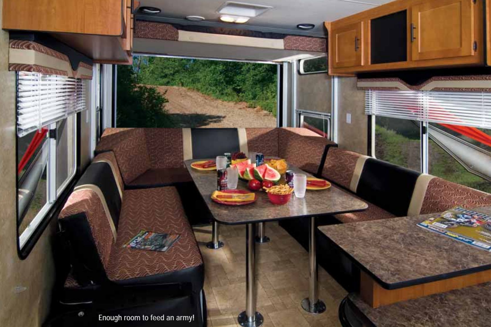
Enough room to feed an army!