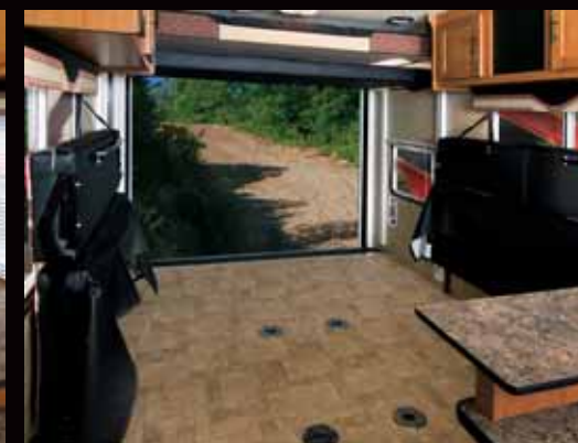
... or Wide Open Cargo Area