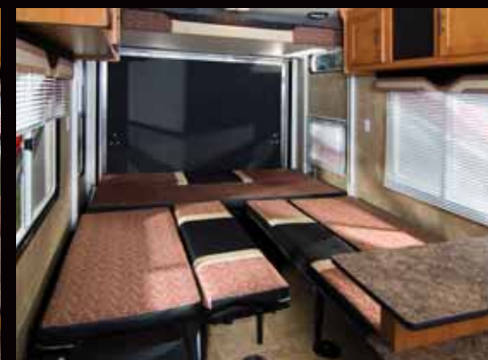
... Quickly Converts to Sleeping