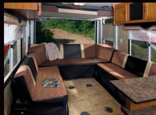
4 Loads of Seating

When you choose a toy hauler it needs to be an extension of your lifestyle, Inferno helps families enjoy the active lifestyle with well thought out floor plans and a level of quality not found in other toy haulers. When you're enjoying your leisure time you want to know that your toy hauler is going to perform; every Inferno is built to last, trip after trip, year after year, so start enjoying the Inferno Lifestyle today.